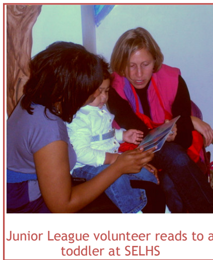
Junior League volunteer reads to a toddler at SELHS

The Coalition was thrilled to have been chosen!